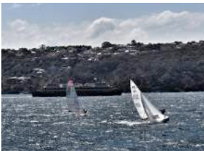
The Manly Ferry, the turbulent water, and the pensioners' craft of choice.

The event was co-staged with the Flying Dutchman's ..... but how things have changed! The former Olympic Class dinghy with the huge genoa (and herculean crew) is now a craft of choice for pensioners.