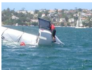
Mark Lainson clearing seaweed from the centreboard (practically sound but tactically disastrous).

Fortunately, the B14 continues to grab the attention of talented youngsters and (in the case of McCrae), middle-aged gentlemen who would like to believe they are talented youngsters. Women have been another welcome addition to the fleet (one skipper and seven crews) – and they are no slouches having been represented on three of the top five boats.