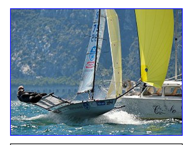
B14s racing on Lake Garda, Italy