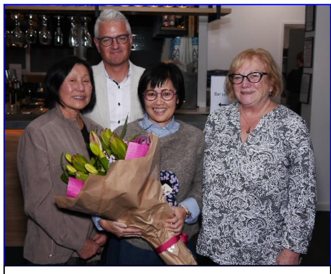
The Catering Stalwarts