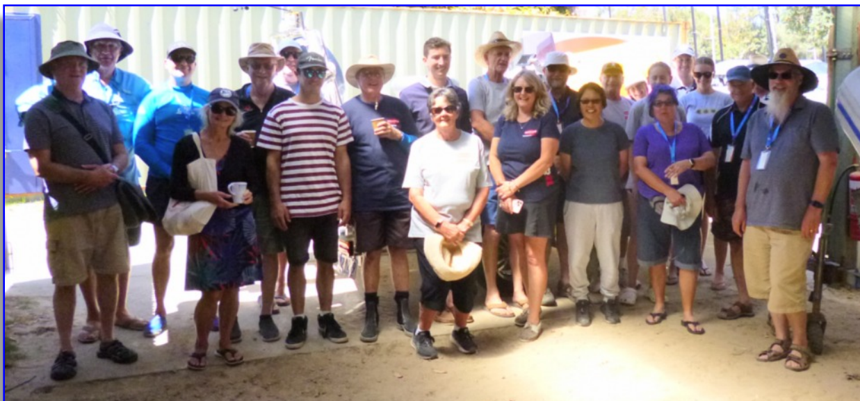
The Club volunteers who made the 2023 Australia Day-Ronstan regatta an outrageous success - and there are more with a few missing from the photo...